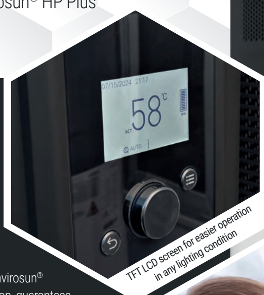
TFT LCD screen for easier operation in any lighting condition

Contact us today to find out how EnviroSun® HP Plus can transform your hot water experience.