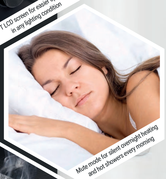
Mute mode for silent overnight heating and hot showers every morning