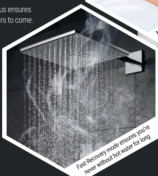
Fast Recovery mode ensures you're never without hot water for long