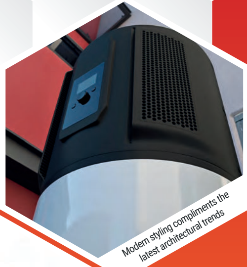
Modern styling compliments the latest architectural trends