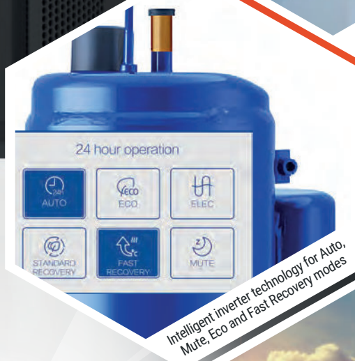
Intelligent inverter technology for Auto, Mute, Eco and Fast Recovery modes