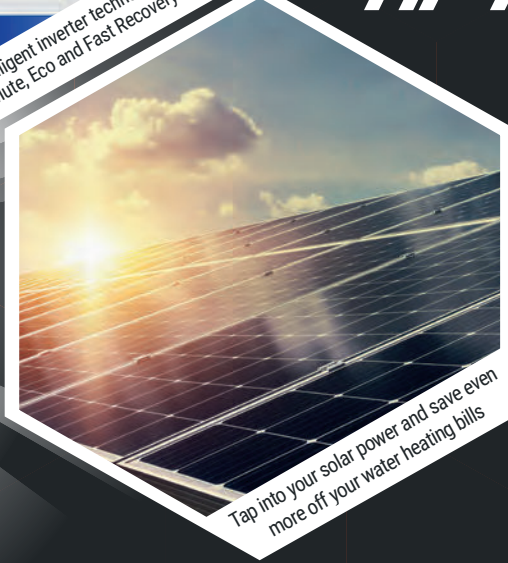
Tap into your solar power and save even more off your water heating bills

UP TO 73% CHEAPER* TO RUN * compared to electric hot water systems